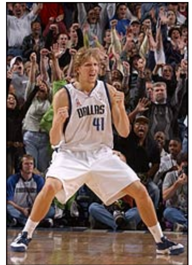
Dirk Nowitzki celebrates a Mavericks win.

The Mavs clearly enjoy each other's company, and appreciate the circumstances that brought them together. "I think it's funny having people from all over the place, coming together to play basketball on one court," Nowitzki says. "The best thing is everyone is a great guy and having a fun time in the locker room and hanging out with each other. I guess we all like each other and like to do stuff together. That's the best thing about it."