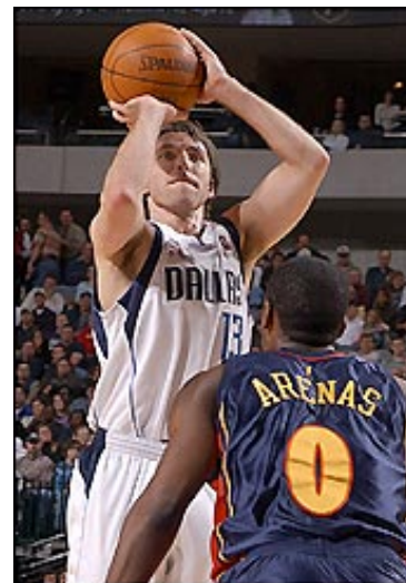
Steve Nash takes a jumper.

Each outlander brings a different look to the team. Nash, a lean and unimposing figure when at rest, disrupts defenses with continuous motion and body control adapted from his experience playing soccer. Allowing a